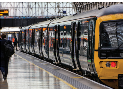
Mass Transit Railway

EYENOR SOLUTION FOR MONITORING AND ENHANCING THE SURROUNDINGS