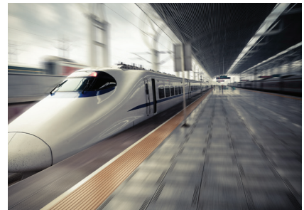
Mass Rapid Transit